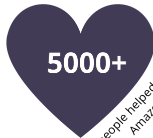
people helped by Amaze