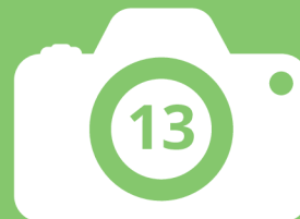
online SENDIASS workshops