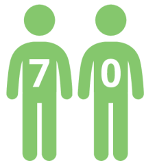
Amaze staff by the end of the year