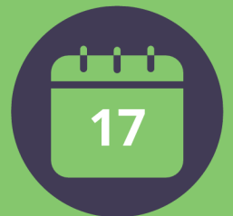
referrals per working day