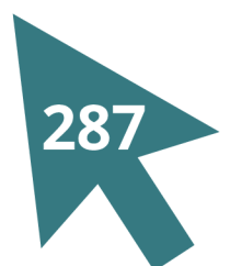
attendees of online DLA or PIP workshops