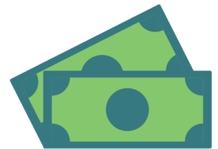
£1.5m+ in income