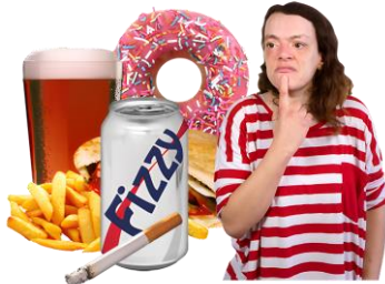
Food, Drink and Smoking