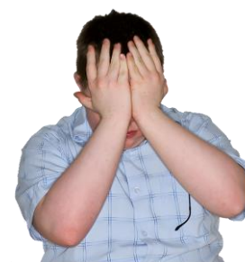
Feelings and Emotions