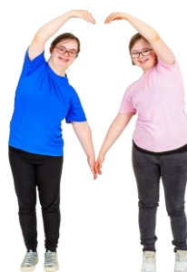
Friendships and Relationships