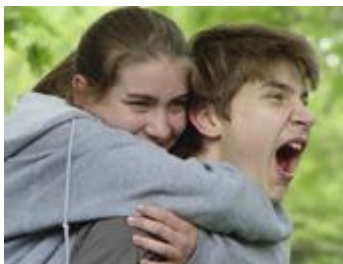
Prepare for the future