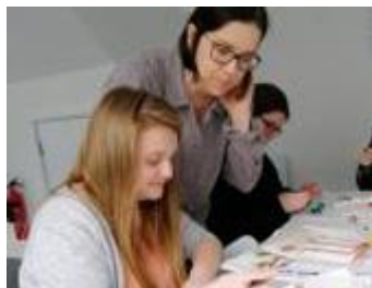
Life Skills sessions